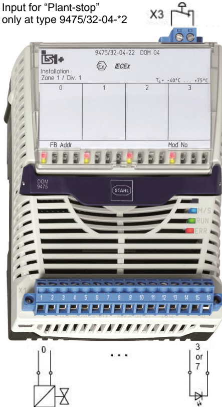
Approved intrinsically safe solenoid valves, indicating lamps

Input for "Plant-stop" only at type 9475/32-04-*2