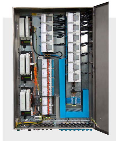
Zone 1 field station with Ethernet Remote I/O and integrated valve terminal (DOMV series 9478)