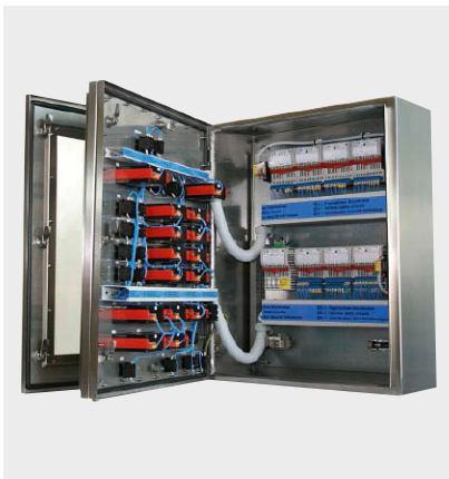
Zone 2 field station with front components and protective screen