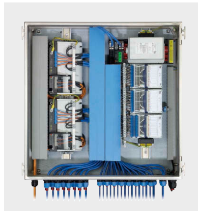
Zone 1 field station with PROFIBUS DP, Remote I/O and FF H1 fieldbus couplers