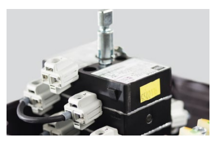
Load and motor switch 8006