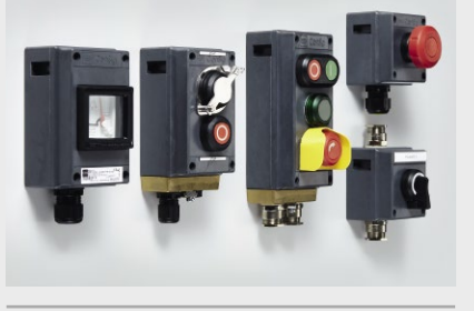
CONTROL AND MONITORING DEVICES SERIES 8040

Made of high-quality, glass-fibrereinforced polyester resin, the 8146 series offers multiple sizes. Each local control station can be easily equipped with different components according to requirements.