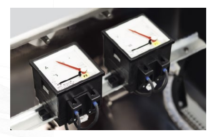
Voltmeter and ammeter 8402, 8403, 8404, 8405, 8406, 8407